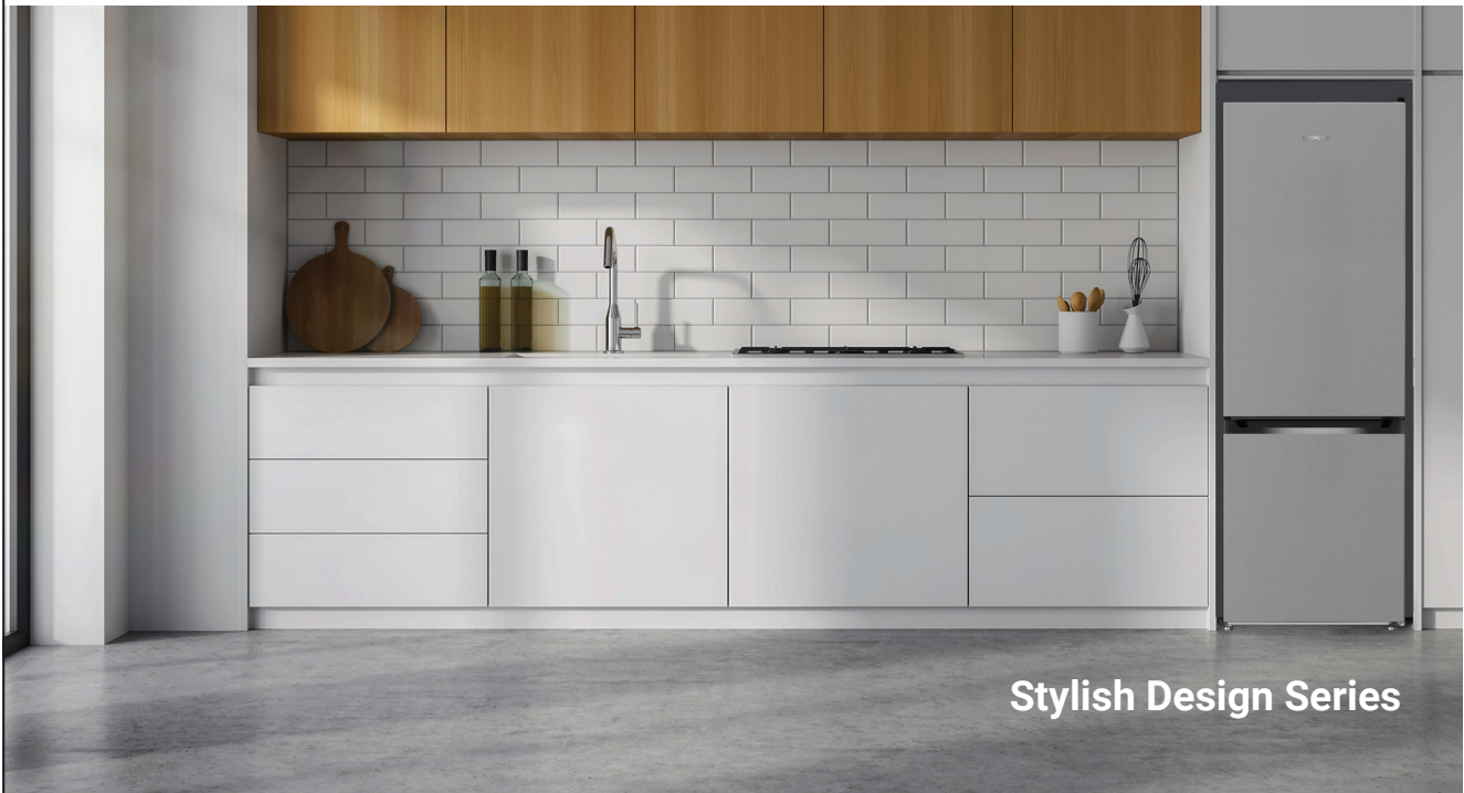
Stylish Design Series